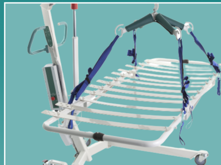
Jordan Frame - LF01

Useful for: Floor lifts where spinal or orthopaedic injury is suspected