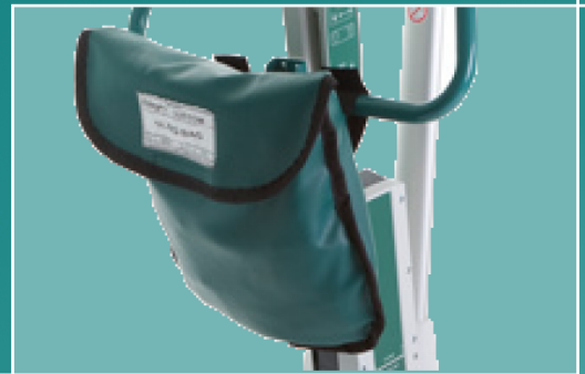
Sling Bag - SB01

Useful for: Storing slings, Swift Slide Sheets and Patient Transfer Belts on the end of patients beds