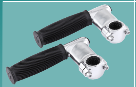
Tempo Handle Kit - THK01

Useful for: Hemiplegic patients who require optimum gripping position with the one functional hand