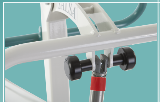
Knob Kit - KK01

Useful for: Conditions such as Multiple Sclerosis where transfer ability can fluctuate within a short space of time