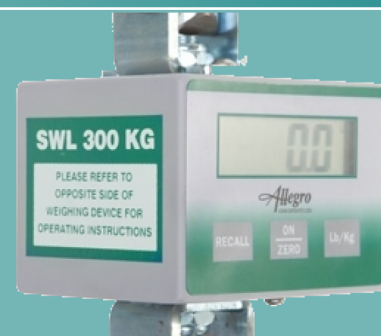
Weigh Scale - WD03

Useful for: Patients requiring constant monitoring of weight for general wellbeing