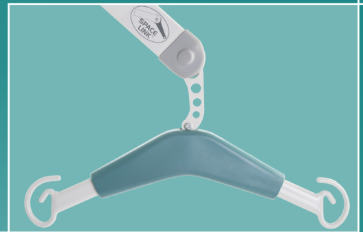
Standard Yoke - SY02

Useful for: All day-to-day patient lifting