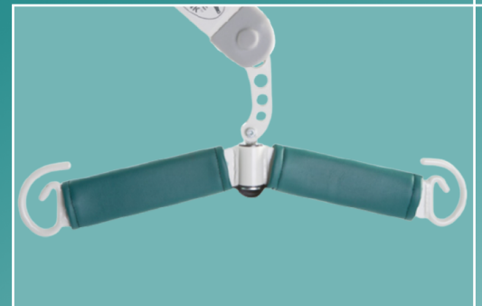
Hi-Lift Yoke - SY02HL

Useful for: Reducing the loss of lifting height when installing an Allegro Universal Weighing Device