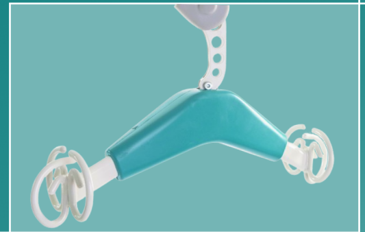
Tri Hook Yoke - SY03

Useful for: Facilities which have historically trained with this configuration