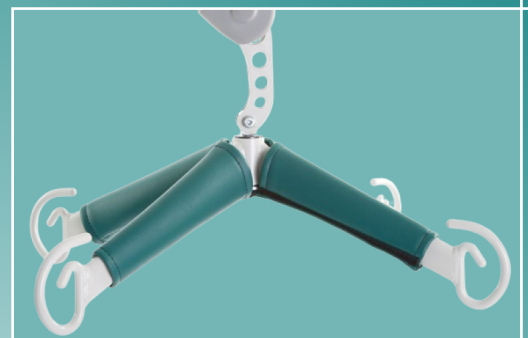
Power Pivot Frame - PPF01

Useful for: Supine lifting devices eg. Jordan frame