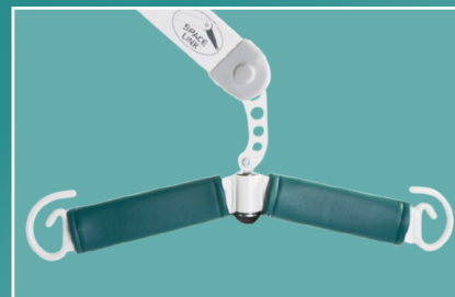
Hi Lift Yoke - SY02HL