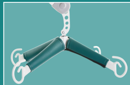
4 Point Yoke - SY04