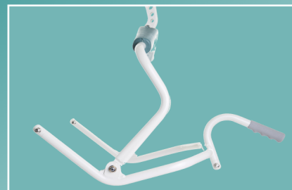
Pivot Frame - PF01