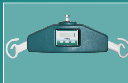
Standard Yoke with Integrated Weigh Scale - SY02WD