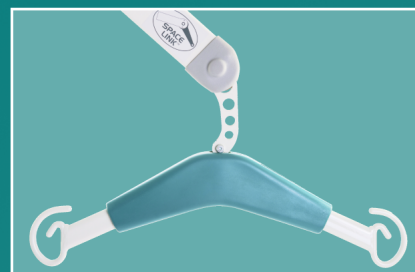
Standard Yoke - SY02