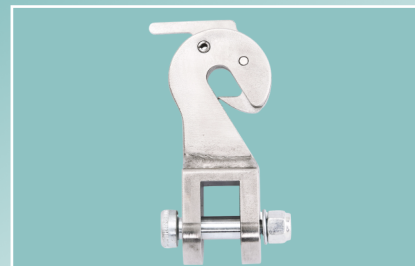
Quick Release Adapter - QRA01